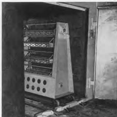
Rack, with load of Variacs, then goes into an oven to bake the thermosetting varnish.

For three years Variacs with the treated track surface have been under extensive and tortuous tests in General Radio laboratories. While controlled laboratory tests are important, every