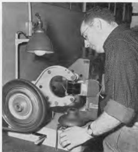
Variacs are precision wound on toroidal winders of our own design and manufacture.

fixed setting for a long period of time. The oxides of copper have relatively high resistance, and this causes a cumulative heating effect under conditions of fixed load. It is obvious that a potentially destructive cycle exists in this situation. Under certain adverse conditions (high ambient, high load, fixed brush setting, continuous operation, infrequent maintenance), a destructive cycle can be initiated which will ultimately lead to failure.