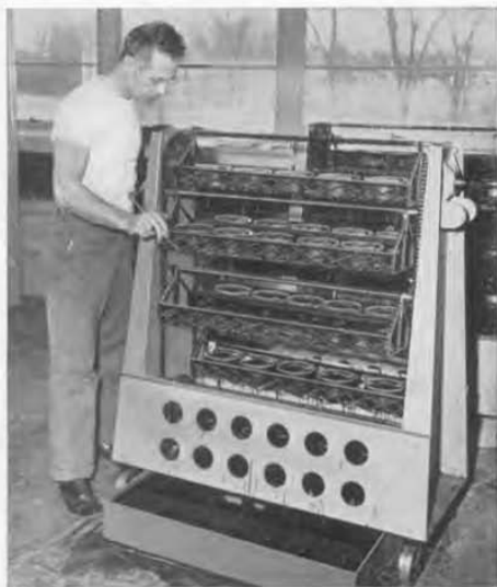
After winding, Variac coils are dipped in baking varnish in specially designed racks.

One of the earliest uses of these new Variacs was in the new liners S. S. Constitution and S. S. Independence . Variacs are used to provide complete and flexible control of the lighting in salons and dining rooms of these luxurious ships. It is obvious that the nature of the service places a high premium on reliability. To