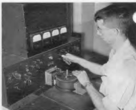
Prior to shipment, all Variacs must pass a series of rigid electrical tests to assure conformance to specifications.