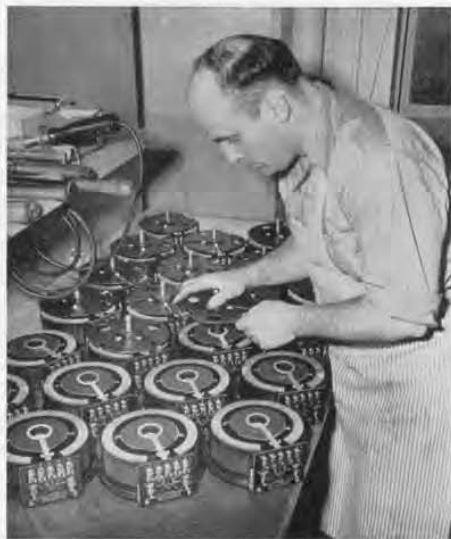
The Duratrak process, which follows baking, coats the brush track with the silver surface shown on these partially assembled units.

Another startling comparison between the new Variacs and a conventional unit was obtained in the process of operating a new unit and an untreated unit on a "pump-back" test. In this connection, the circuit current is limited only by internal impedance of the two units, and the voltage difference between the two brushes must be kept small. In one instance the brush of one unit was rotated far enough to develop practically full line voltage in the low impedance circuit. The resulting circulating current burned out the untreated unit almost instantaneously. The treated unit was substantially undamaged.