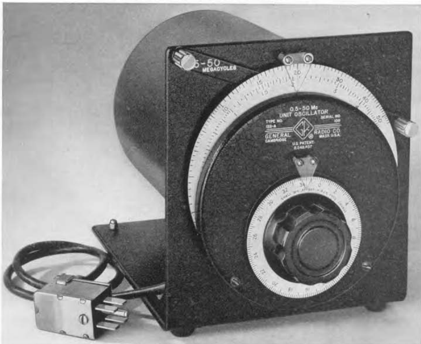
Figure 1. View of the Type 1211-A Unit Oscillator.