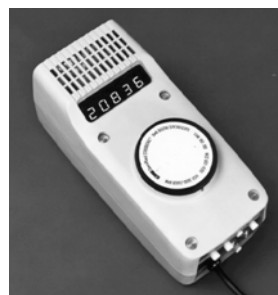
Figure 2: 1531-A/1538-A and 1546 STROBES

For complete product specifications on the 1500 Strobe Line contact IET Laboratories at 1-800-475-1211 or on the web at www.ietlabs.com .